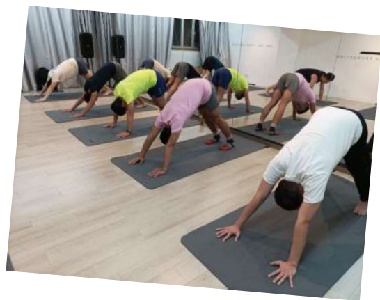
瑜伽活動 Yoga Activities