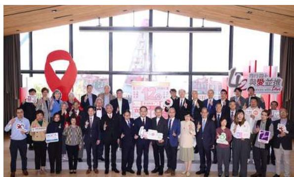
全球同抗愛滋病運動 2024 啟動禮