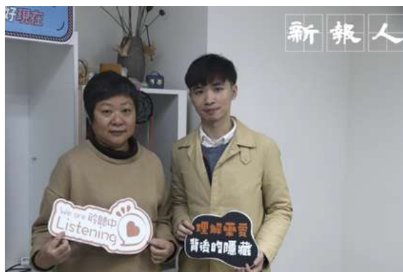
《新報人》採訪 “Spyan-jour.hkbu” interview