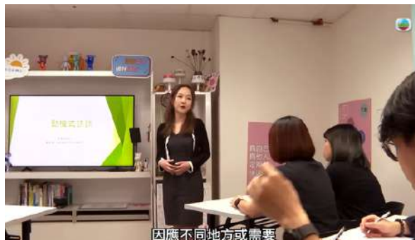
因應不同地方或需要 “Sunday Report - 四十不惑” Interview