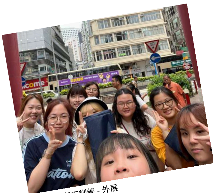
驕陽計劃義工訓練 - 外展