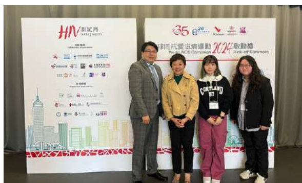
World AIDS Campaign 2024 Kick-off Ceremony