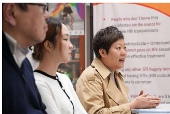
CT goodjobs 採訪 Interview