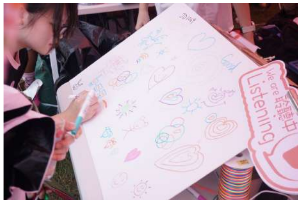
2024 Pink Dot HK