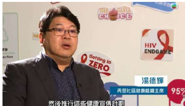
然後推行這些健康宣傳計劃 《星期日檔案 - 四十不惑》採訪